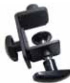
ADJUSTABLE C-CLAMP -Allows Easy Mounting of an LCD Monitor Display on a Desk