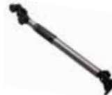
TELESCOPING SUPPORT BRACE -Provides Extra Support For Mobotron's In-Vehicle Laptop Mount