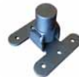
UNIVERSAL FLOOR MOUNT -Allows Mounting On Vehicle Floor