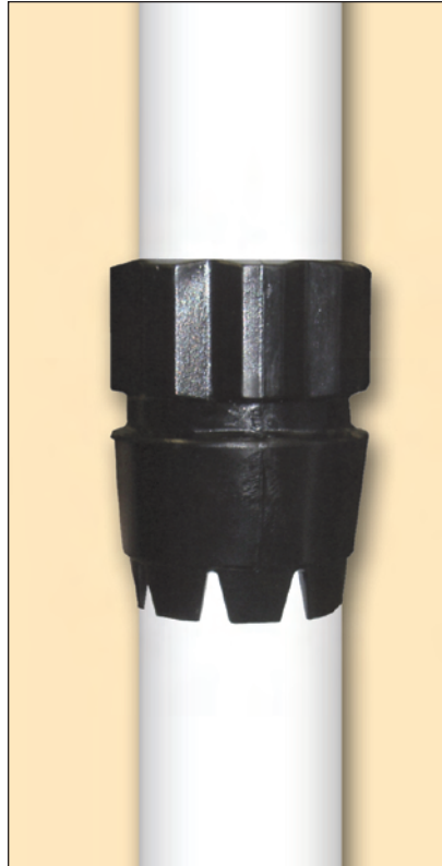
RUPP collar pre-installed. Mounting arm available through dealer.