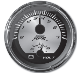
Scale may vary depending on model.

Use stranded, insulated wire not lighter than 18 AWG. Be certain wire insulation is not in danger of melting from engine or exhaust heat or interfering with moving mechanical parts. It is recommended that insulated wire terminals, preferably ring type be used.