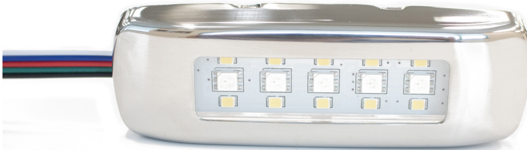
Shown with optional 316 S.S. Snap-On Bezel

055-43250-1 RGBW Trilite 055-9902-1 316 S.S. Snap-On Bezel