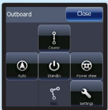
SmartSteer™ Outboard Pilot Modes