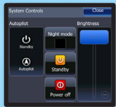
SmartSteer™ Outboard Pilot Controls