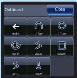
SmartSteer™ Outboard Pilot Turn Patterns