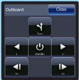
SmartSteer™ Outboard Pilot Auto Mode