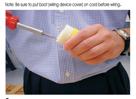
] Back out the three recessed screws and separate sections.

DISCONNECT FROM POWER SOURCE. RINSE PLUG/CONNECTOR THOROUGHLY IN FRESH WATER, SHAKE OR BLOW OUT EXCESS WATER, AND ALLOW TO DRY. SPRAY WITH MOISTURE DISPLACEMENT BEFORE RE-USE. Use in wet condition we strongly recommend use of weatherproof covers (102N, 103RN, or 103ELN).