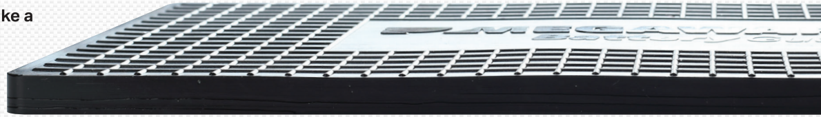
Dimensions: 12 3 / 4 " x 6 7 / 8 " x 3 1 / 8 "

Megaware BatteryGuard™ Acts Like a Shock Absorber for your Battery