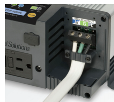
Integrated AC Power Strain Reliefs with Front Screws