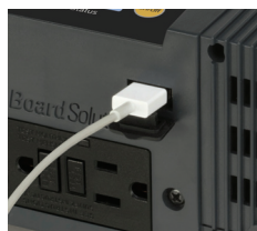
USB 5 VDC/2.1 Amp Port GFCI Protected Outlets