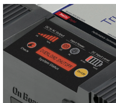
Intuitive Dual Color Display and LCD Message Center