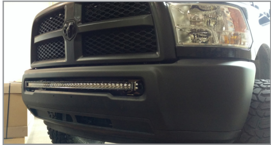
40" Bar Installed without Factory Tow Hooks