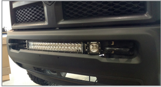
20" Bar Installed with Factory Tow Hooks and Optional D-Series