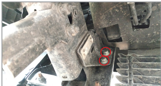
Tow Hook Mounting Nuts (Shown from Behind Bumper)