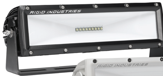
2x10 115° Scene Light - Black