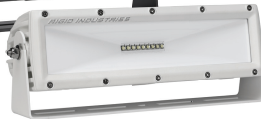
2x10 115° Scene Light - White