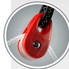
KITE BLOCK on 'Pigtail'