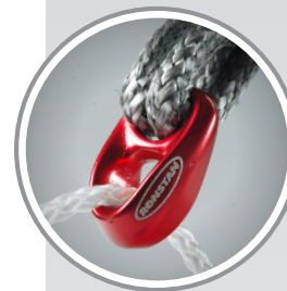
SHOCK on Dyneema® Link