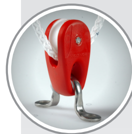
KITE BLOCK on Saddle