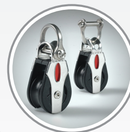
RF20101 with Shackle - 2 ways