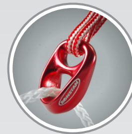
SHOCK on Lashing