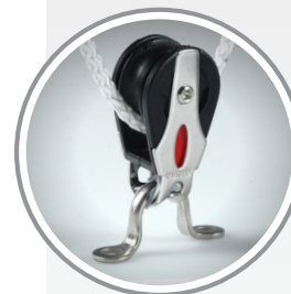
RF20101 on Saddle