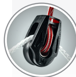
RF25109 on Lashing