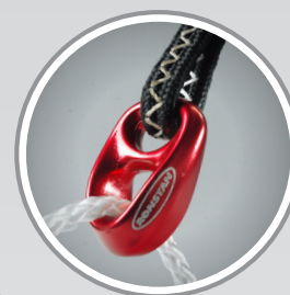
SHOCK on 'Pigtail'