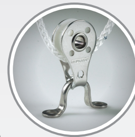
RF666 on Saddle