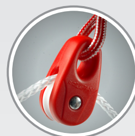
KITE BLOCK on Lashing