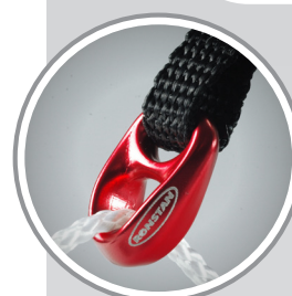
SHOCK on 8mm webbing