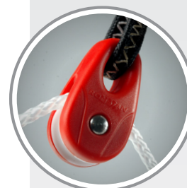
KITE BLOCK on 'Pigtail'