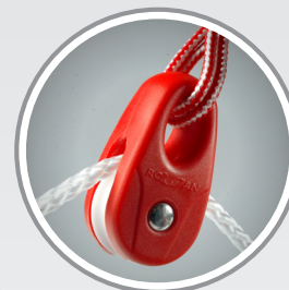
KITE BLOCK on Lashing