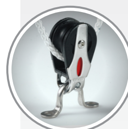
RF20101 on Saddle