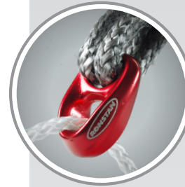
SHOCK on Dyneema® Link