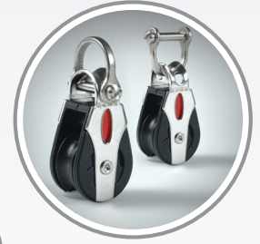
RF20101 with Shackle - 2 ways