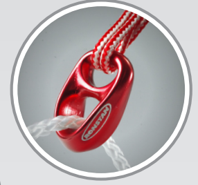
SHOCK on Lashing