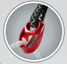
SHOCK on 'Pigtail'