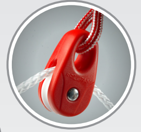
KITE BLOCK on Lashing