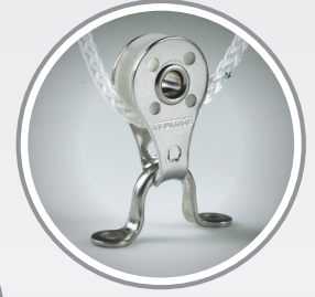
RF666 on Saddle