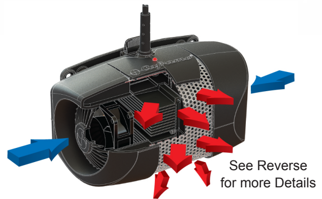
See Reverse for more Details